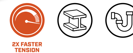
2X FASTER TENSION