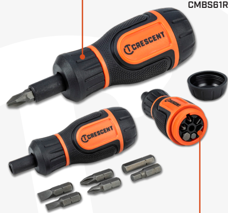
End Cap Bit Storage Keeps bits organized and easily accessible